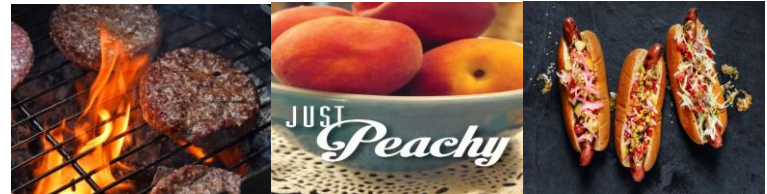
HAMBURGERS – PEACH SUNDAES – HOTDOGS – SALADS